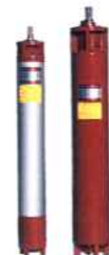
Submersible pump motors