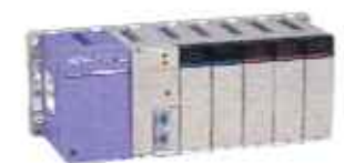
Industrial Control Systems & Products ( PLC)