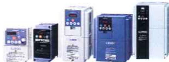
AC Drives (Inverters)