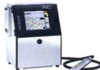
Ink Jet Printers