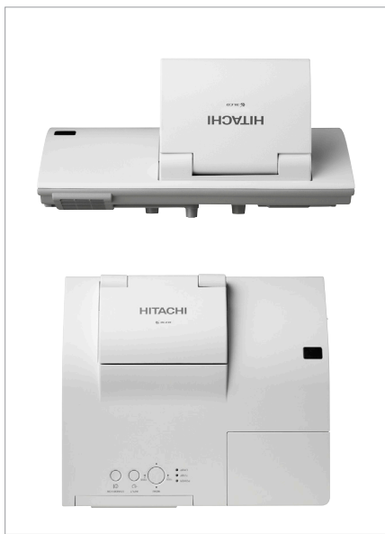
Aspect Ratio 4:3